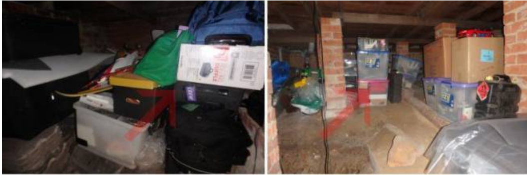
Below the following location or area: Various areas of the subfloor: