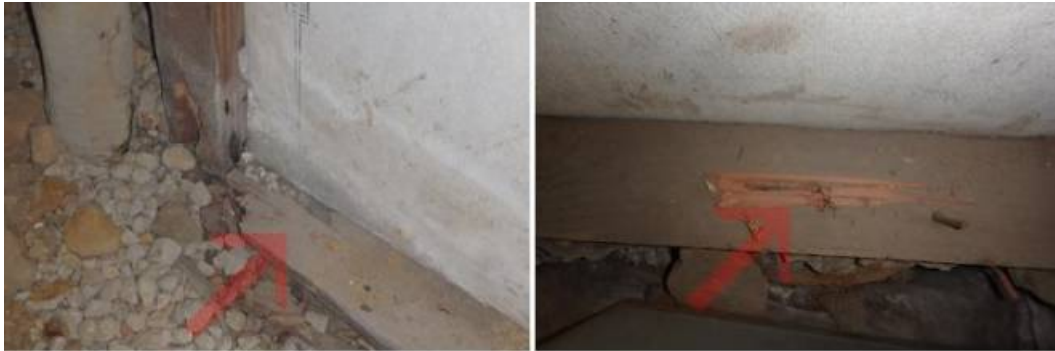
Below the following location or area: Right hand section: